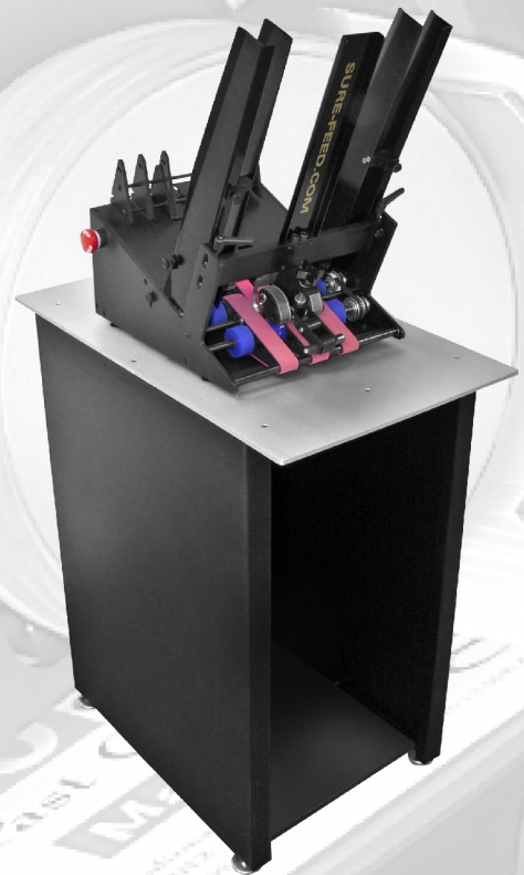
Sure-Jet Cabinet Stand