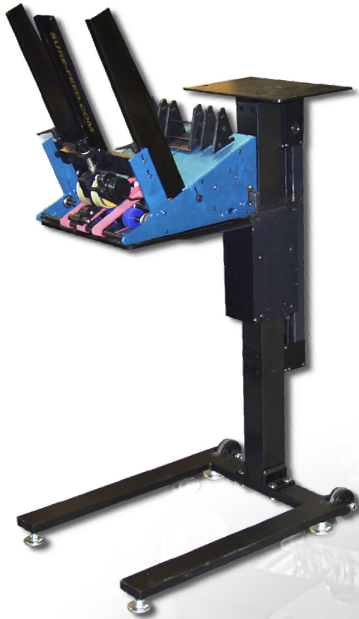
VPS (Versatile Platform Stand)